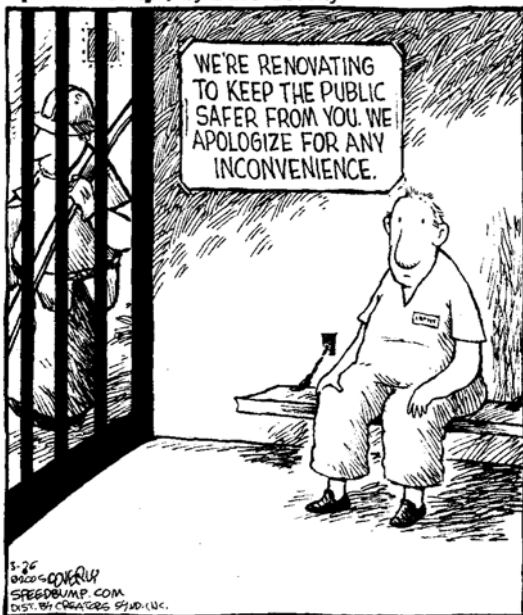
Speed Bump / by Dave Coverly